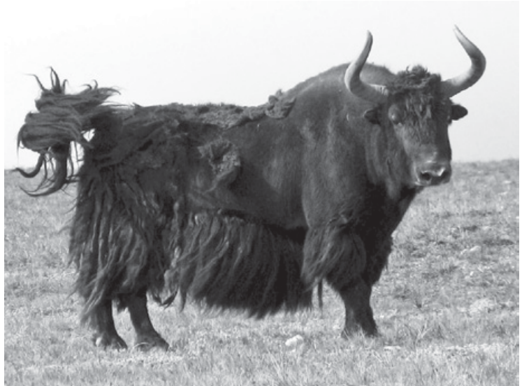
The yak provides the nomads with food and clothing.